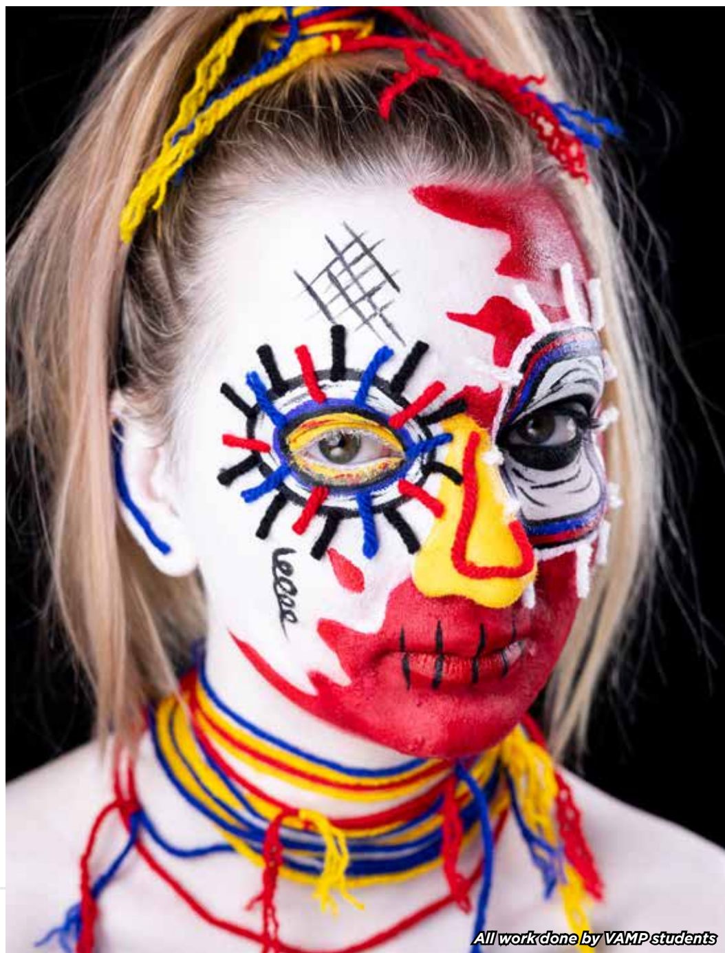
All work done by VAMP students

VAMP complies with the Americans with Disabilities Act of 1990; the school facility is wheelchair accessible. The school does not offer a Comprehensive Transition Postsecondary Program for students with intellectual disabilities.