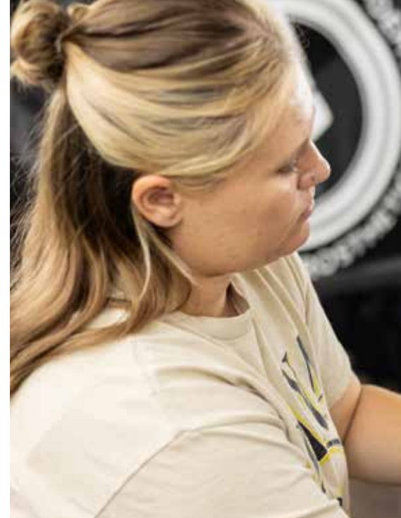
All work done by VAMP students