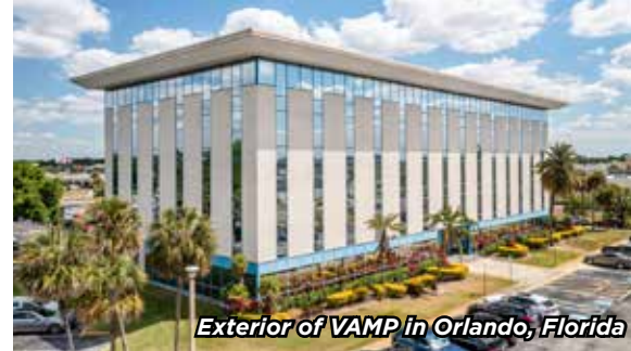
Exterior of VAMP in Orlando, Florida

The Vocational Academy of Makeup and Prosthetics is a professional makeup training school located in Orlando, Florida. We seek to provide our students with a modern education in the field of professional makeup artistry. We offer comprehensive courses teaching both special makeup effects as well as beauty makeup. VAMP is also home to one of metro Orlando's most comprehensive makeup effects stores.