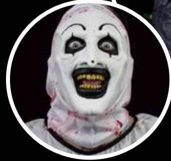
All work done by VAMP students