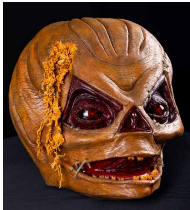
All work done by VAMP students