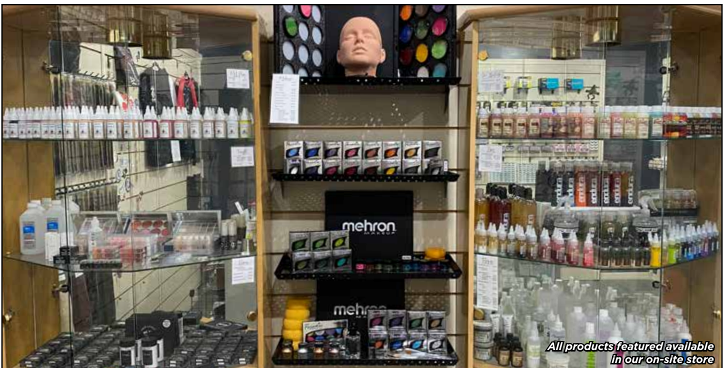
All products featured available in our on-site store