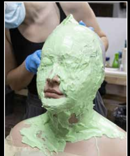
All work done by VAMP students