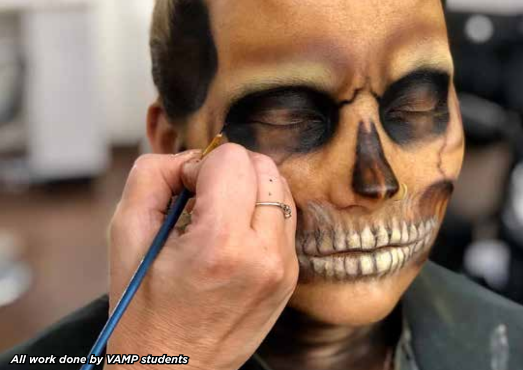
All work done by VAMP students