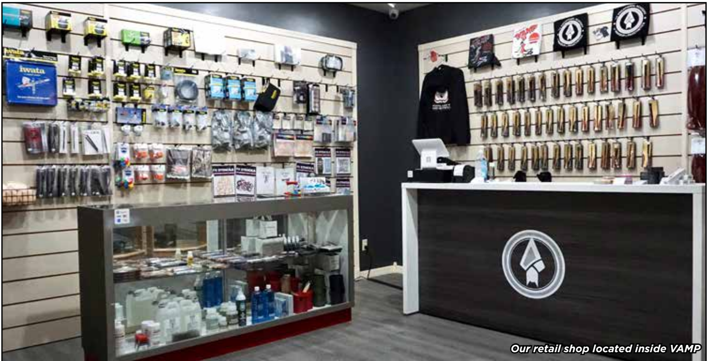
Our retail shop located inside VAMP

ADM Tronics Prosaide • Alcone Third Degree • Bdeillum Tools • Cinema Secrets Derma Shield • European Body Art • Iwata • Ken's Tools • Kryolan MAQ Pro • Mehron • MEL Products • Paasche • Premiere Products Inc. • RCMA TEMPTU • Ve's Favorite Brushes • WM Creations ...and more!