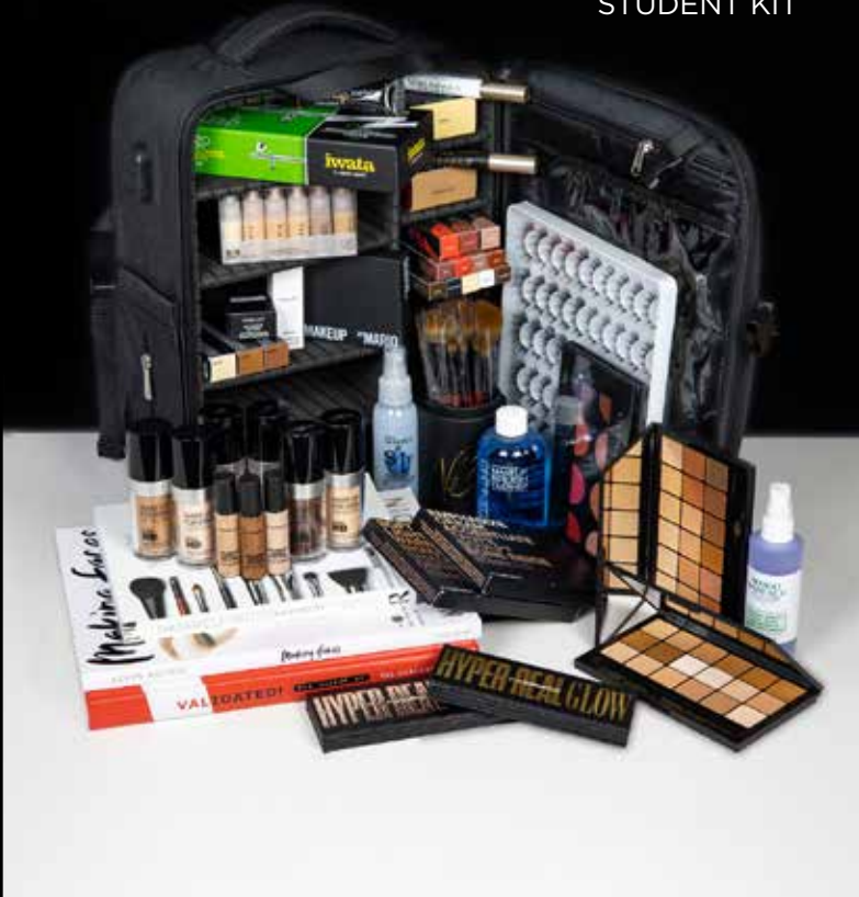
BEAUTY PROFESSIONAL MAKEUP ARTISTRY STUDENT KIT