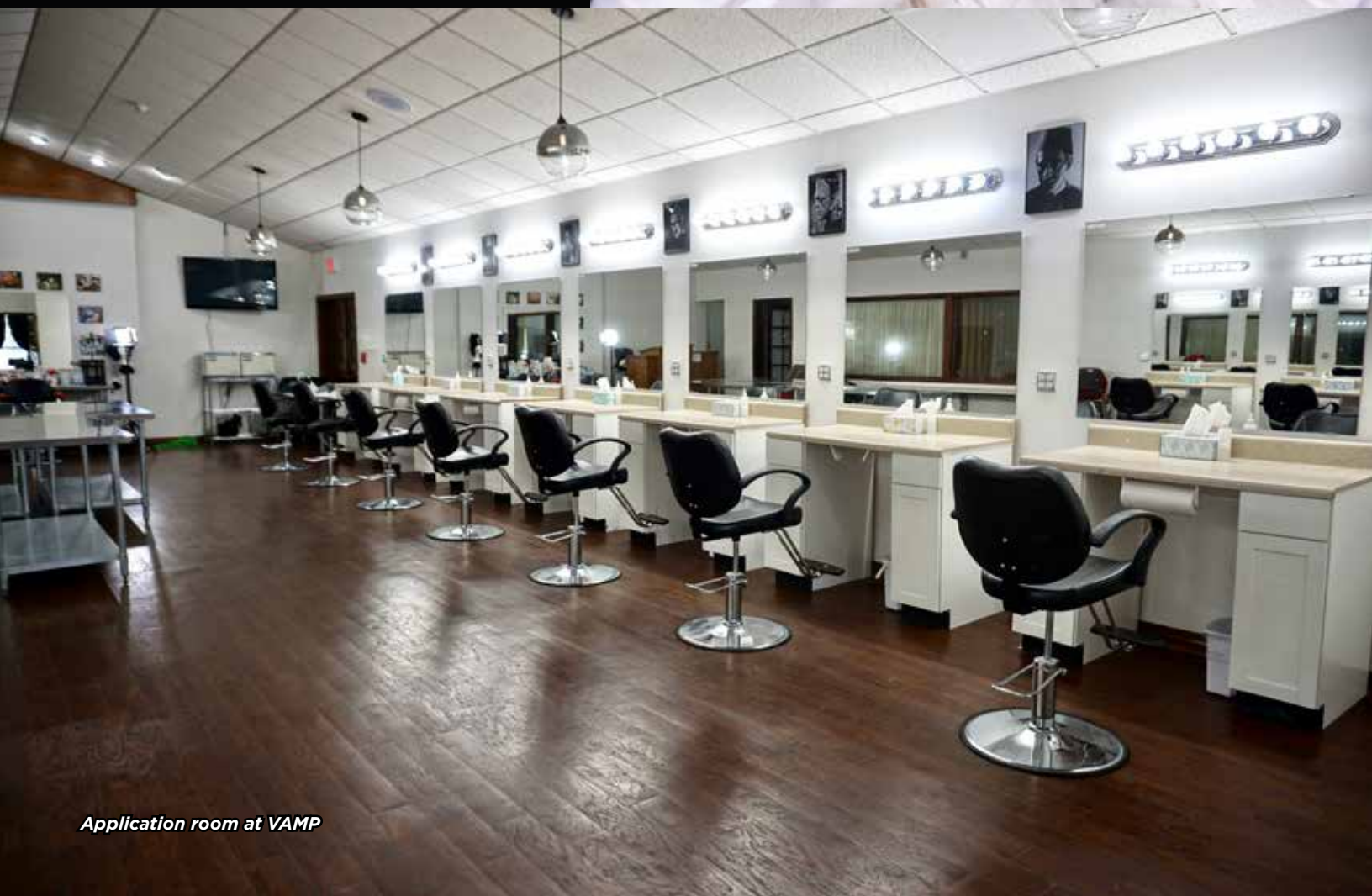
Application room at VAMP