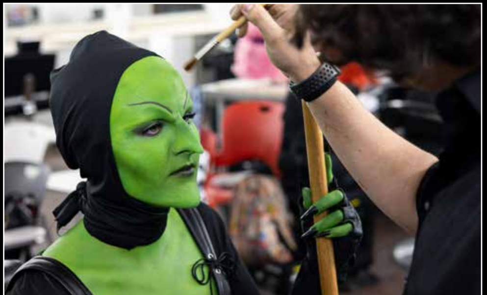
All work done by VAMP students